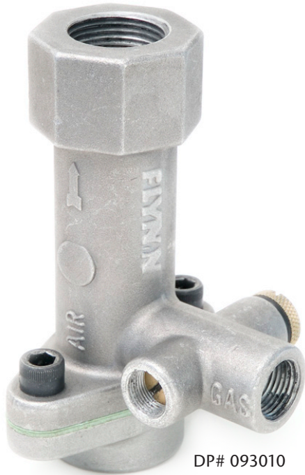
DP# 093010 (3/4" NPT INLET - 3/4" NPT OUTLET)